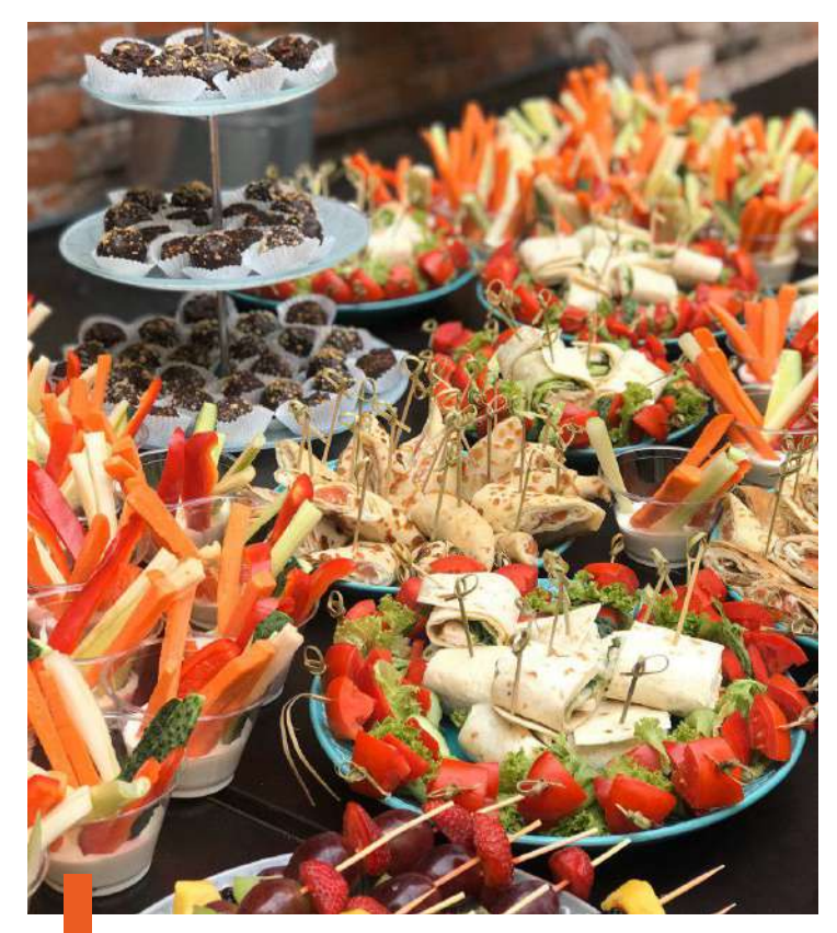
Exclusive menu for catering services.