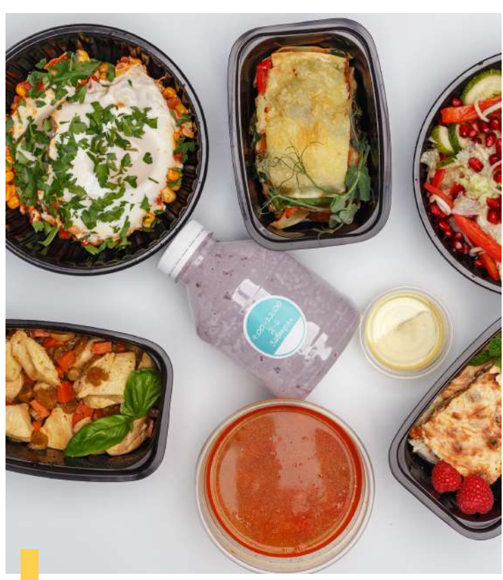
An exclusive menu of retail items of healthy and wholesome dishes with a calculation of kcal and taking into account all the necessary vitamins and minerals.