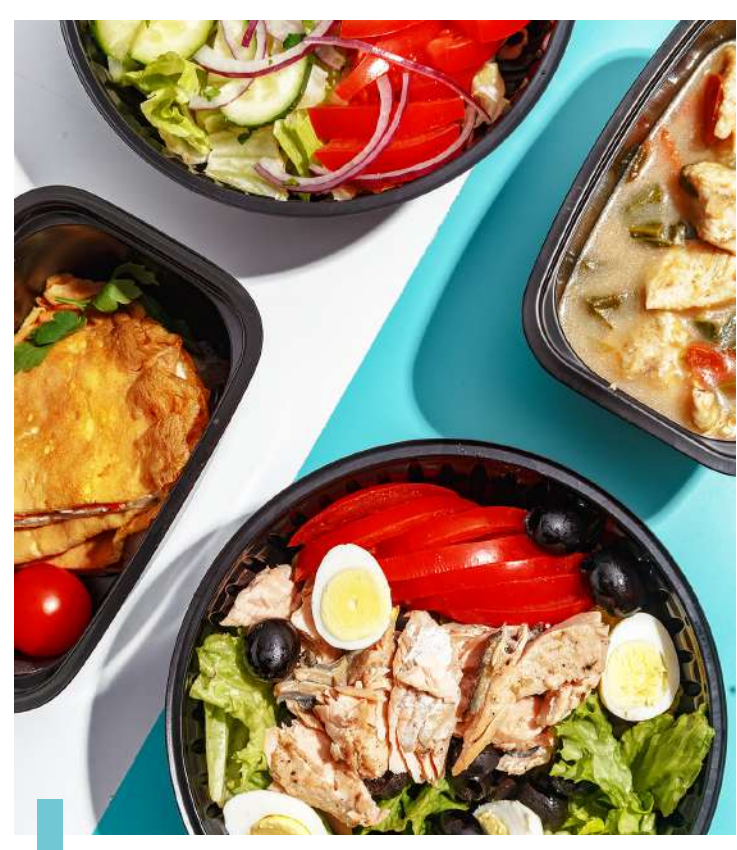
Balanced business lunches for corporate and individual service.