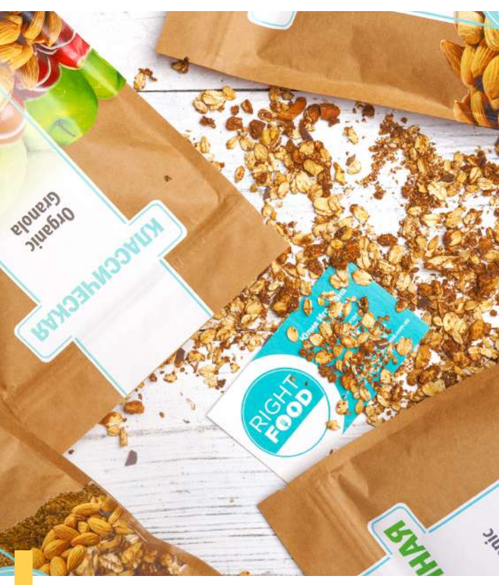
Granola is a line of breakfast cereals with health benefits.