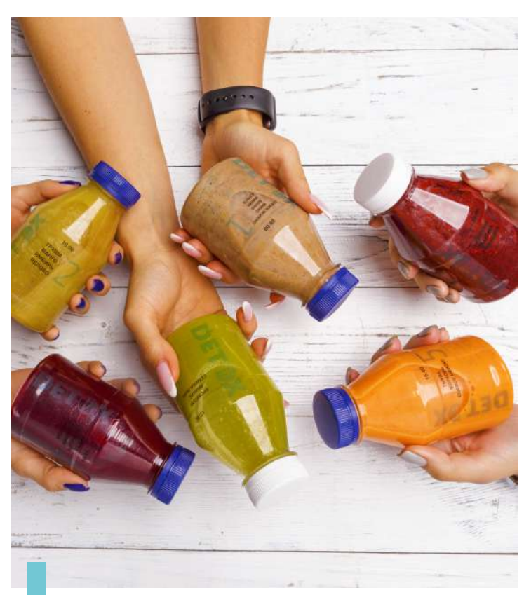
DETOX Program is a line of smoothies and juices for cleansing and rejuvenating the body.